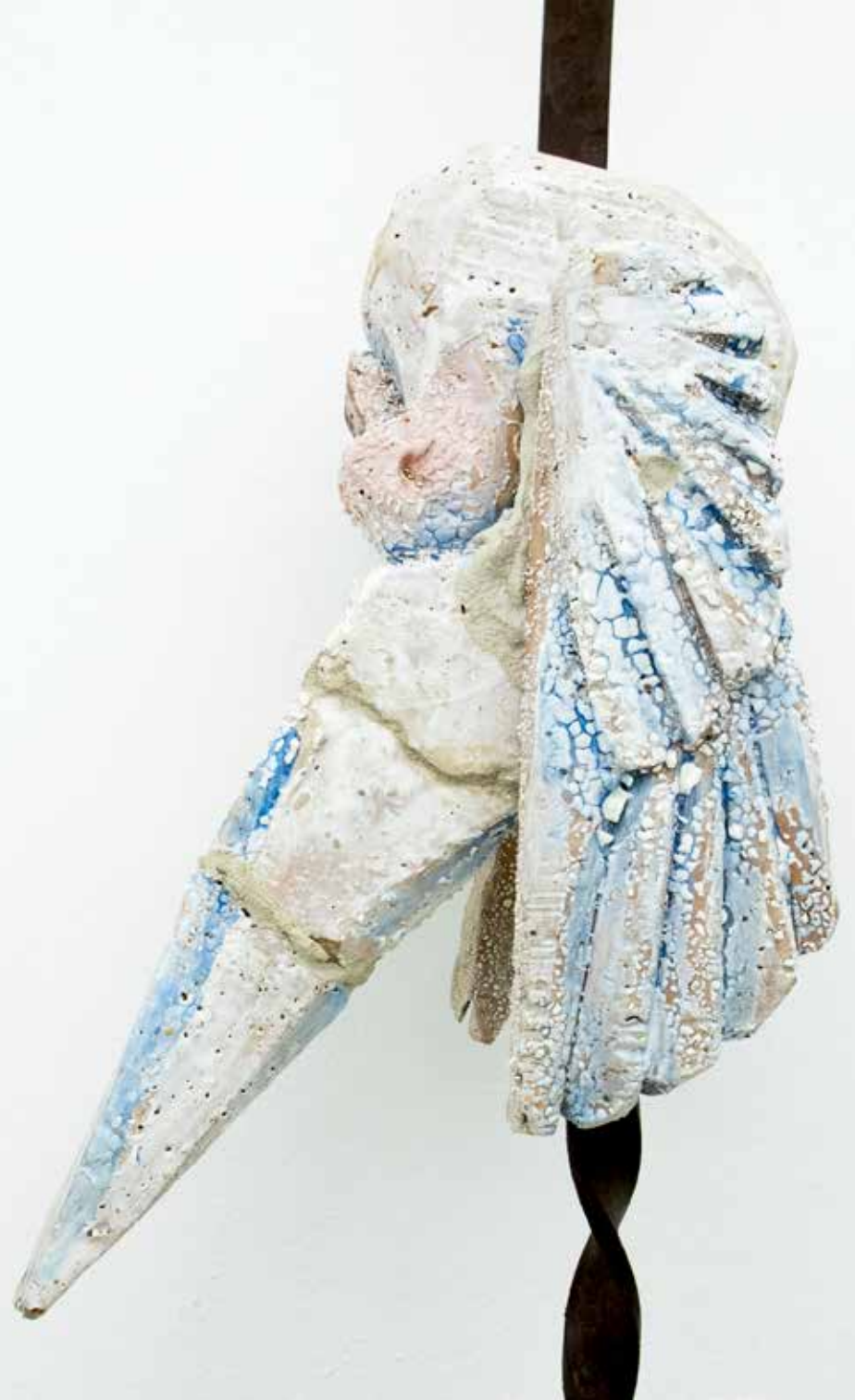
>>Give Peace A Lance<< 2023 Glazed clay tiles, wrought iron; 235 x 20 x 15 cm