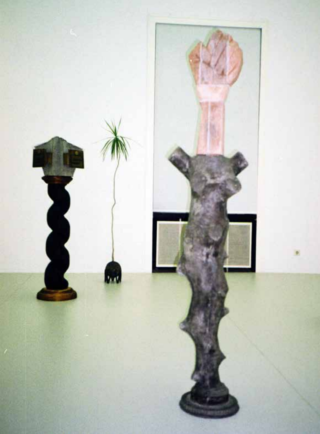
Exhibition View: >> Solide Anlage (Solid Investment) << , >> They Paved Paradise << and >> Widerstand (Resistance) <<

Pagel flexibly locates her often two-part sculptures between Aristotelian poetics and Brechtian dialectics – that means on the one hand between the examination of means of expression, function and effect of sculpture and on the other hand the consideration of socio-political dimensions. It is obviously important to her that both the causal relationships and the ethical dimensions are explicitly understandable and that the arousal of emotions and a critical, rational attitude are not mutually exclusive.