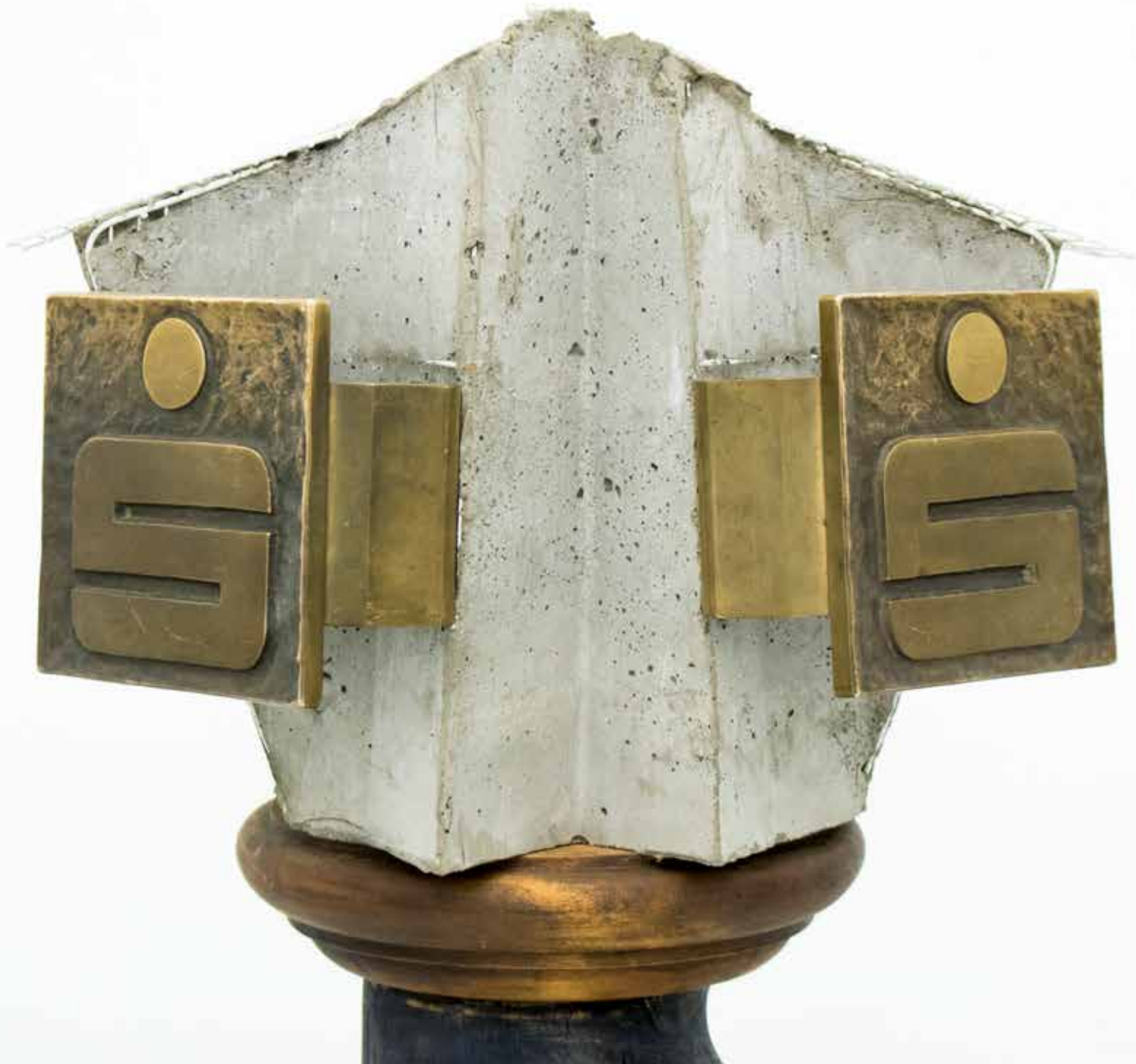
Detail: >>Solide Anlage (Solid Investment)<<