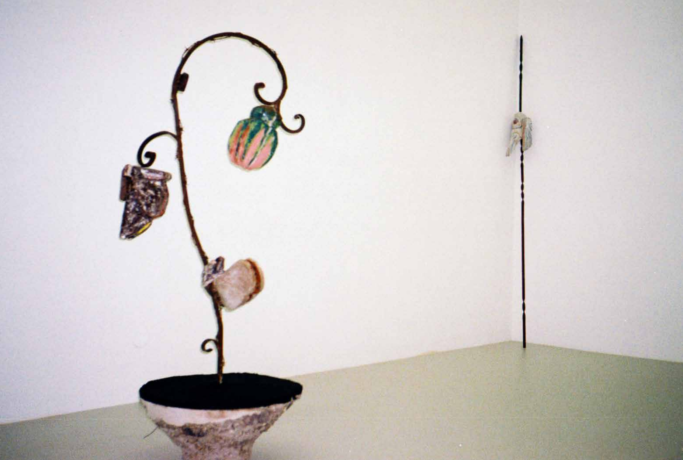
Exhibition View: >>Sorry we are closed<< and >>Give Peace A Lance<<