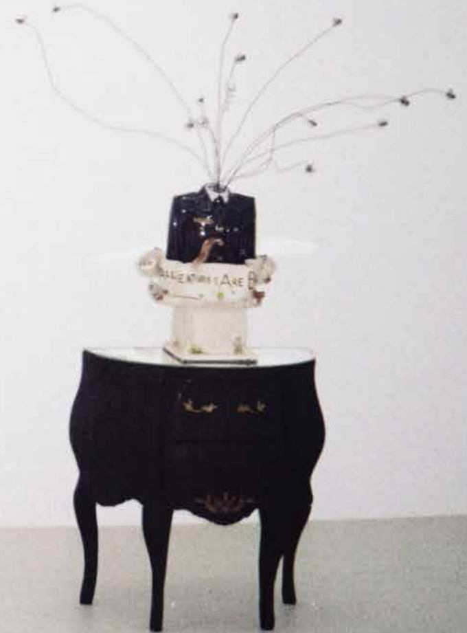
Exhibition View: >> Spirit of Extas << and >> All Creatures Are Beautiful <<