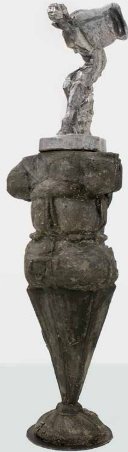
>> Spirit of Extasy << 2023; glazed brick, concrete; 202 x 50 x 50 cm