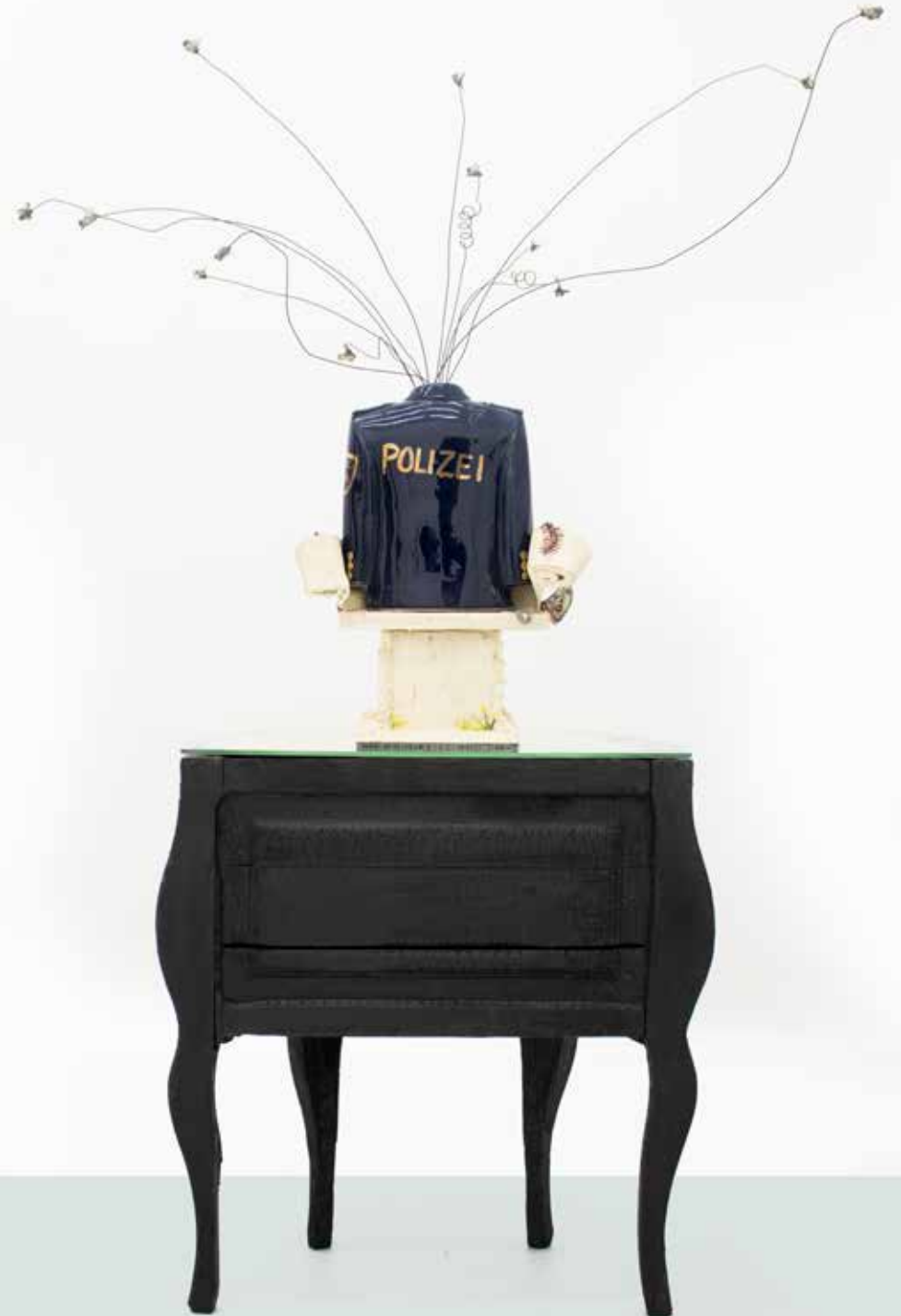
>>All Creatures Are Beautiful<< 2023; Charred wood, pewter fittings, mirrors, glazed ceramics, metal; 117 x 60 x 30 cm (without flies)