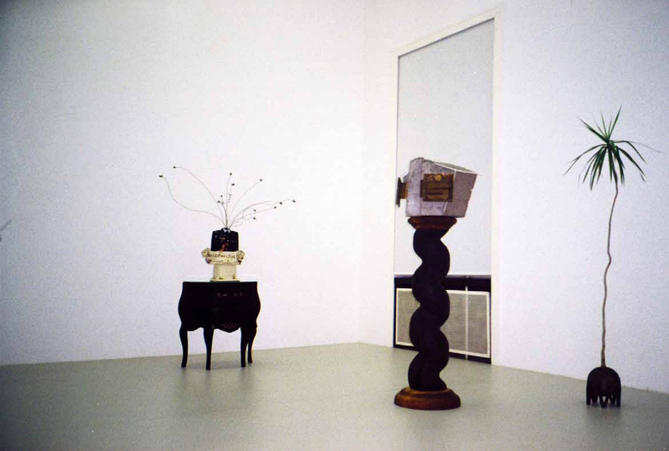
Exhibition view: >> All Creatures Of Beautiful << , >> Solide Anlage / Solid Investment << and >> They Paved Paradise <<