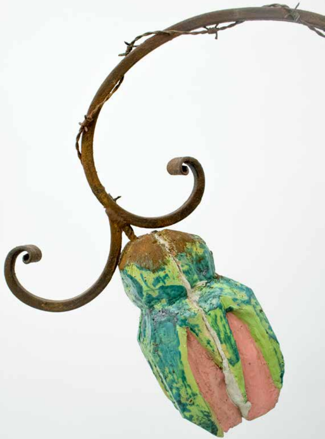
>>Sorry we are closed<<2023 Glazed brick, concrete, wrought iron, barbed wire, asphalt 150 x 70 x 50 cm