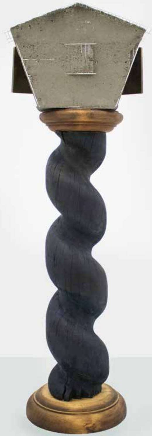
>>Solide Anlage (Solid Investment)<< 2023; Wooden column, bronze, concrete, birdhouse; 153 x 50 x 37 cm