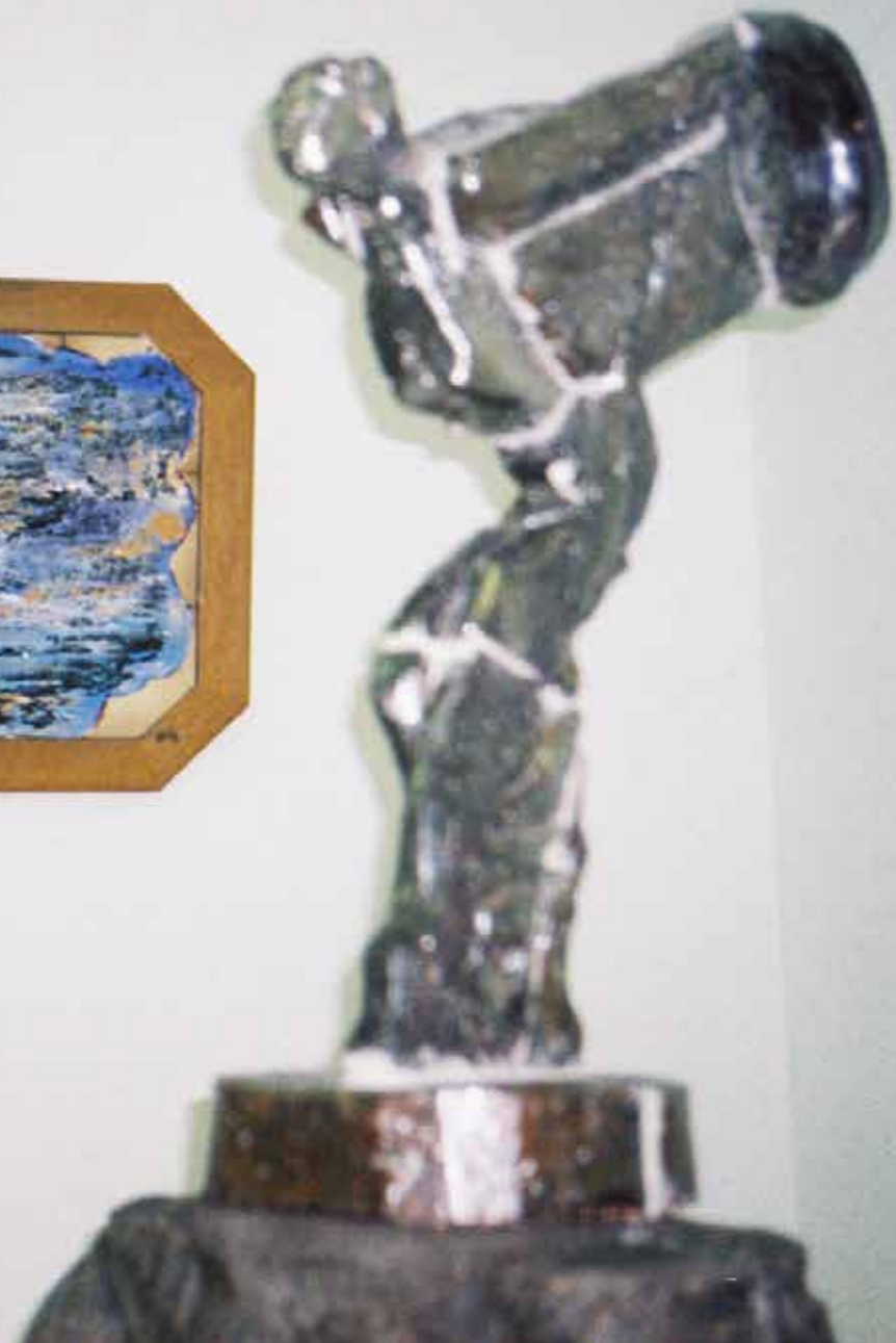
Exhibition View: >> Abendhimmel (Good night white pride) << and >> Spirit of Extasy <<