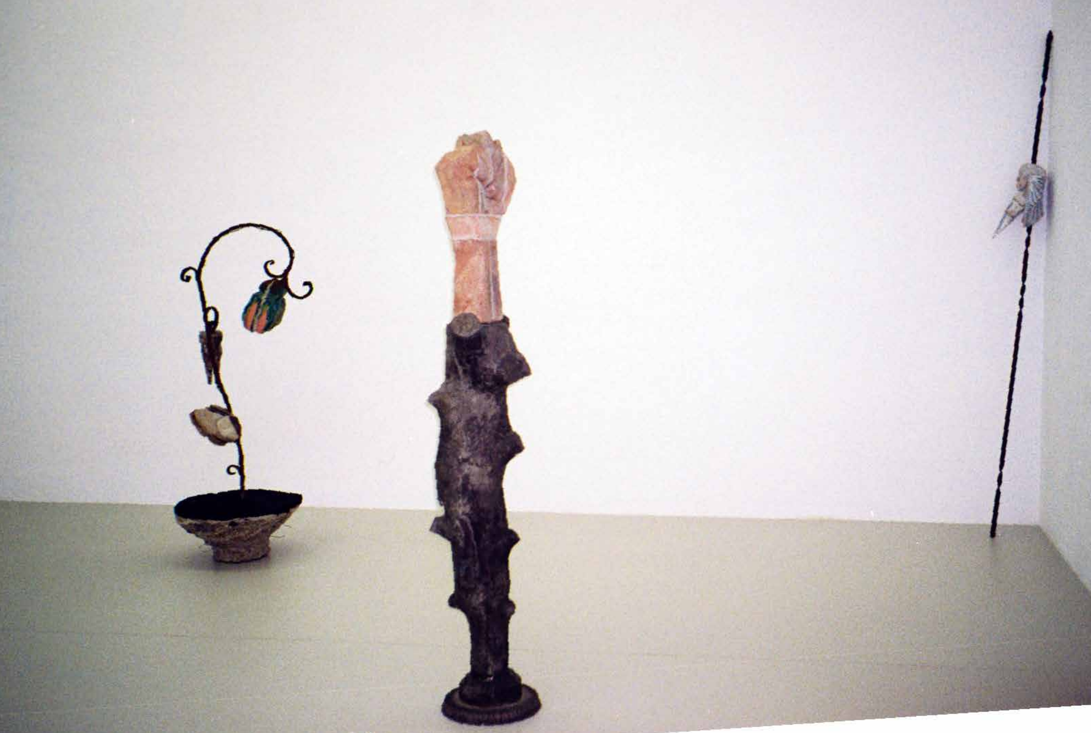
Exhibition View: >>Sorry We Are Closed<< , >>Widerstand (Resistance)<< and >>Give Peace A Lance<<