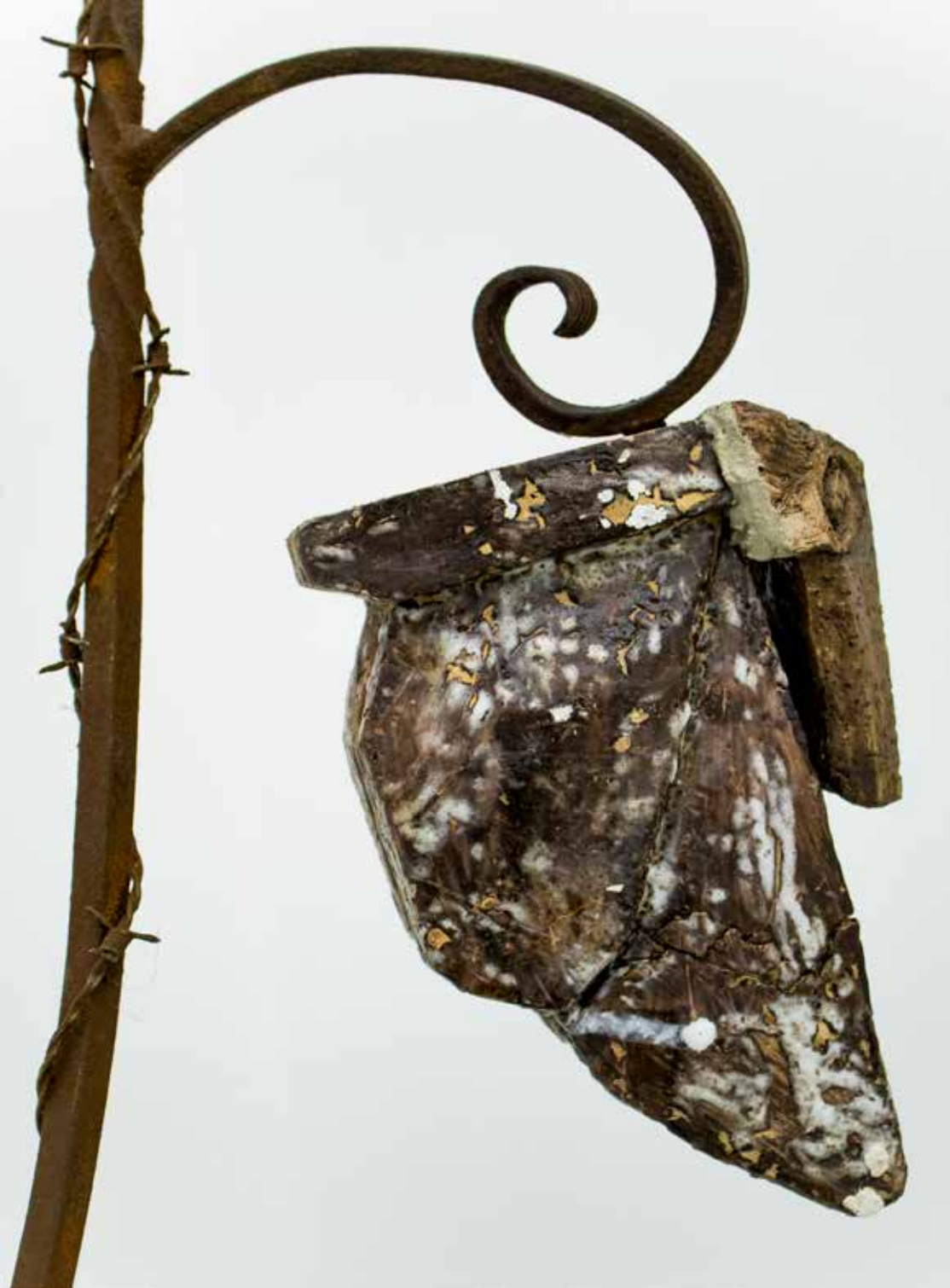
Detail: >>Sorry we are closed<<