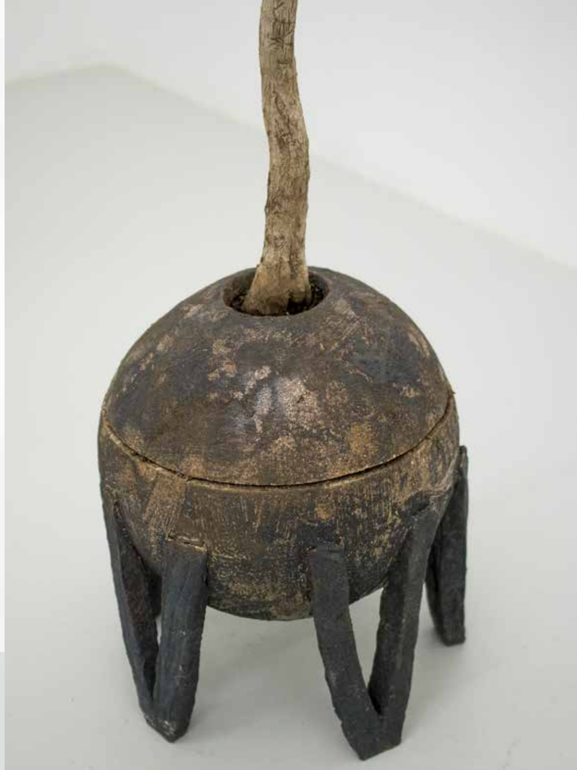
>> They Paved Paradise << 2023; Glazed ceramics, dragon tree; 180 x 20 x 20 cm