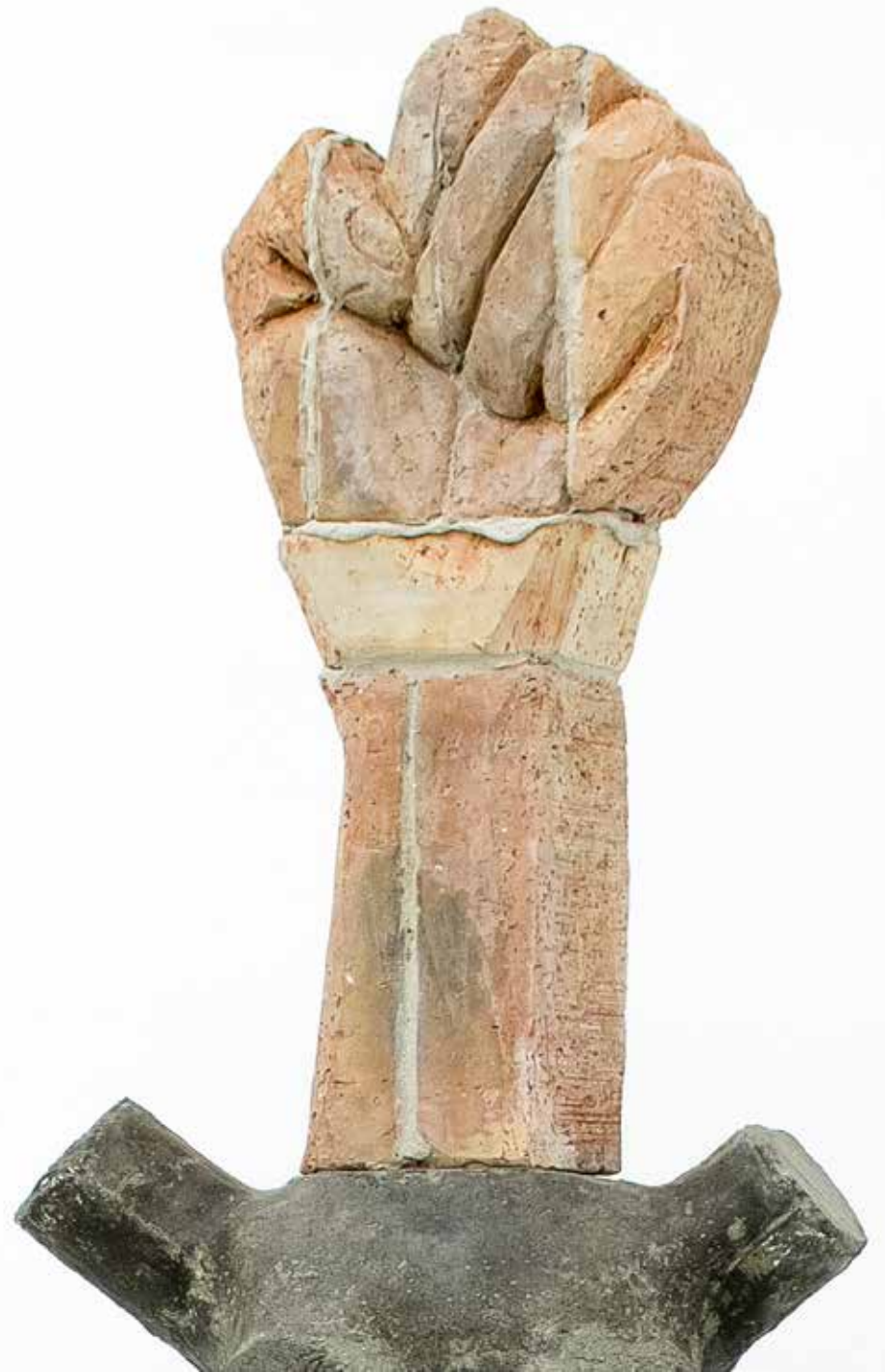
>> Widerstand (Resistance) << 2023; Brick, concrete; 176 x 30 x 40 cm