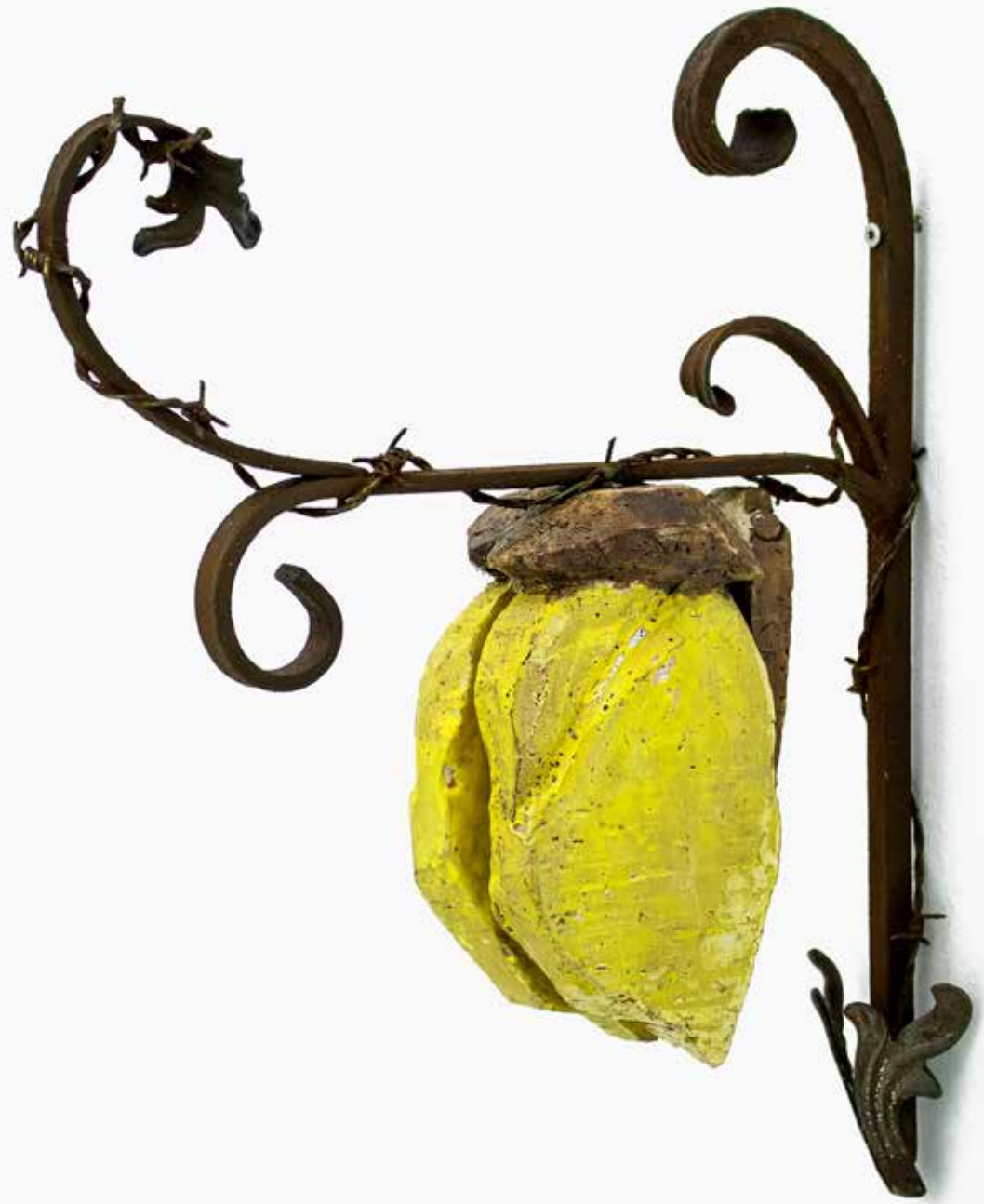
>>Sorry we are closed too<< 2023; Glazed brick, wrought iron; 44 x 35 x 7 cm